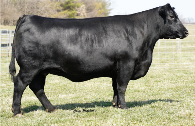
Riverbend Rita G164