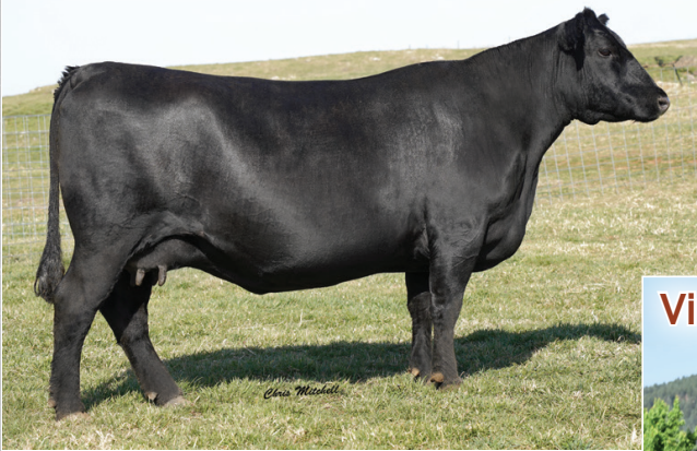
HPCA Sure Fire S6