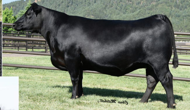
Vintage Henrietta Pride 5010